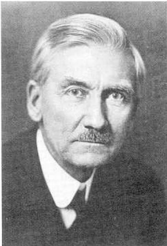
Portrait of Curtis F. Marbut. In charge of soil surveys in the United States from 1910 until his retirement in 1934, Marbut had one career as a geologist prior to 1910 and another as a pedologist afterward.

The three elements that persisted from the beginning are (a) splitting all soils into two classes in the top category, (b) geography as a class criterion, and (c) the concept of soil "maturity." Marbut (1921) first divided