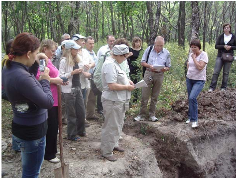
The participants of the field tour “The soils of the catchment of Hanka Lake”: soils with argic horizon.