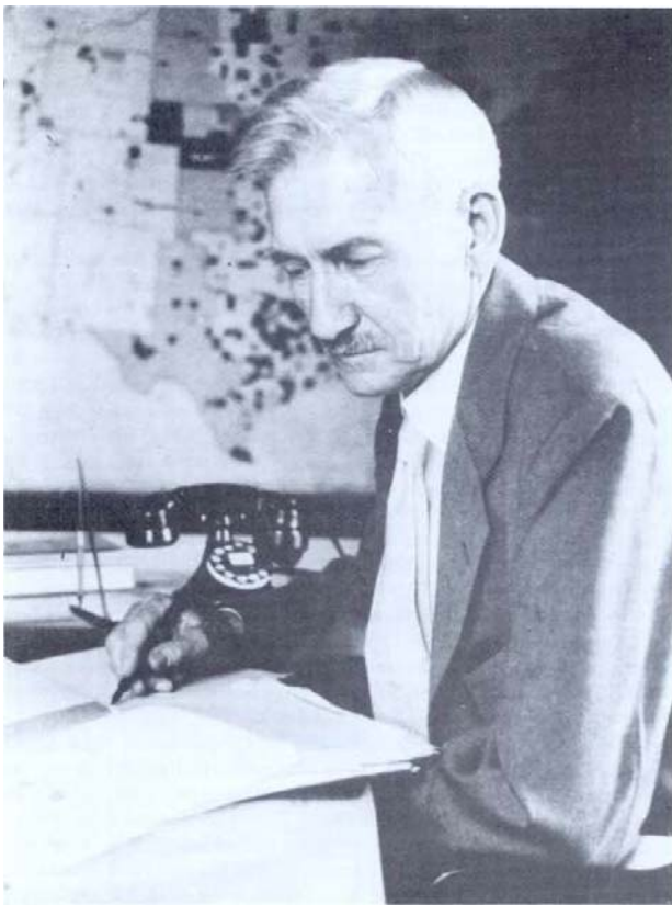
Curtis F. Marbut at his office desk. He was in charge of soil surveys in the United States from 1910 until his retirement in 1934.

The third "soil map" of the United States, published in 1913, had the title "Soil Provinces and Soil Regions of the United States" (Marbut et al., 1913). That map had 13 units, one less than the 1909 map. Ironically, the one map unit in the 1909 legend that had included the word soils – "Residual soils of western prairies" – had been dropped by 1913. Many names in the 1913 legend are those used for physiographic provinces today, e.g., Great Plains, Piedmont Plateau, and Great Basin. Although the 1913 map is not mentioned in the criticisms by Marbut (1928a) of the 1909 map, those apply with equal force to both. Perhaps Marbut did not want to criticize his own efforts. Being senior author of the bulletin that carried the map, however, Marbut must have had major responsibility for it. Having been State Geologist in Missouri prior to joining the Bureau of Soils to take charge of soil surveys in 1910 (Kellogg, 1974), Marbut was apparently satisfied with the ad hoc three-category system through the early part of the decade. The combination of the text in Bulletin 96 and the general "soil map" provides good